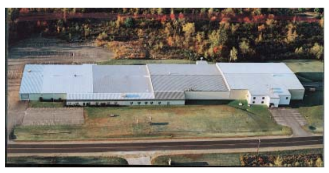
Coilmate Dickerman's 80,000 sq. ft. facility in Clinton, ME

Coilmate/Dickerman has set industry standards for press feed equipment with over 50 years of experience and innovation. We produce 98% of our products in-house and maintain full control of our shop through-put. We designed our 85,000 square-foot facility to optimize development of raw material in the fabrication department to finished product in the assembly department. In between, product moves through a state-of-the- art machine shop with three horizontal turning centers (two with automatic bars feed capability, one with dual turret and turning capacity of 19" diameter), 157" between centers, 6600lbs. loading capacity, multiple CNC machining centers and a CNC Bridge Mill with travel capacity of 69"X x 126"Y x53"Z . All of these components provide critical support to our operation. The facility also has roll hardening and grinding capabilities. We execute programming for the machine shop with Surf cam software and staff our manufacturing department with 71 highly trained employees. Our seven-person engineering staff quickly processes customer orders and provides custom coil processing application solutions. Ten employees in the sales department rapidly respond to customer applications for the fastest quote turnaround in the industry. Our service department responds promptly to customer needs, with locations in Chicago, Dallas, Clinton, ME and Piqua, OH. Customers may speak with a factory technician twenty-four hours a day, seven days a week.